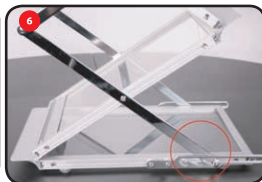
6 POSITION LOCKING PIN AT BOTTOM OF BASE PRIOR TO USING UNIT.