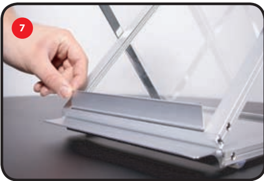
7 SWING OPEN FLAP ON THE BOTTOM SECTION. (MAKE SURE TO FLIP BOTTOM SECTION FLAP FLAT ONTO GLASS BEFORE ATTEMPTING TO RETRACT.)

TO COLLAPSE THE UNIT, REPEAT SETUP INSTRUCTIONS IN REVERSE. BE CAREFUL RETRACTING UNIT