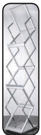
PIN SET IN THIRD GROVE