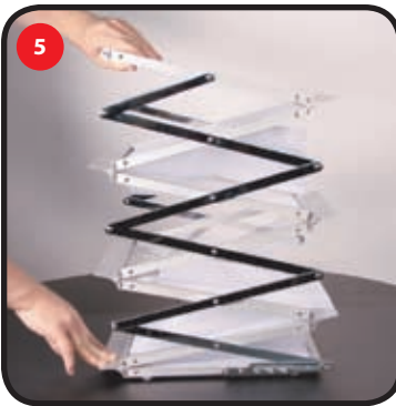
5 WHILE HOLDING DOWN THE BASE LIFT TOP SECTION OF THE UNIT .