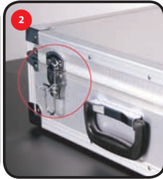
2 OPEN BOTH LATCHES ON THE HARD CASE