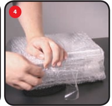
4 REMOVE BUBBLE WRAP FROM UNIT