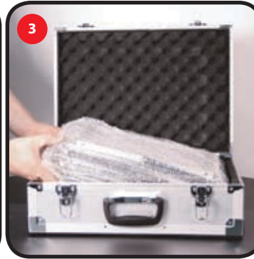
3 REMOVE UNIT FROM HARD CASE