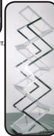
PIN SET IN FIRST GROVE

TO COLLAPSE THE UNIT, REPEAT SETUP INSTRUCTIONS IN REVERSE. BE CAREFUL RETRACTING UNIT