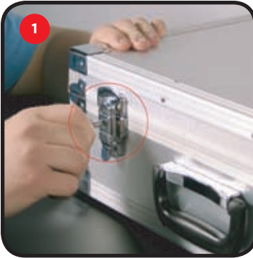
1 IF LOCKED UNLOCK HARD CASE.